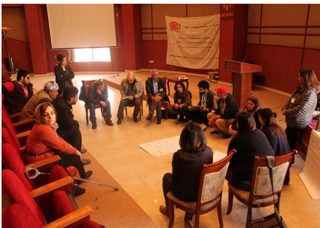
ECBBC strategy planning meeting at the ICSSI conference in March 2022

The casualties dataset (Appendix 2) gives names for the killed, if known, and other demographic and identifying details of the 37 casualties for whom some information in addition to their non-combatant status was available. Names of injured civilians, even when known, have been omitted for privacy reasons. Children are defined as persons 4-17 years old and babies and infants as 0-3.