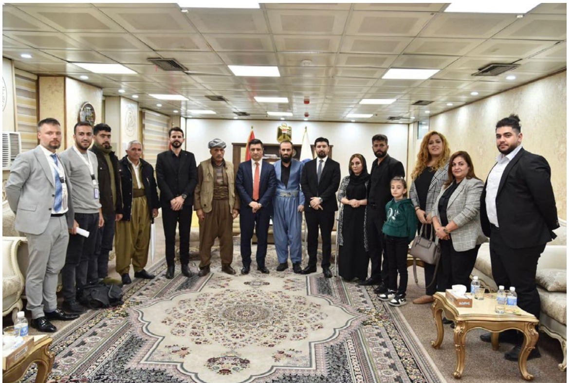
ECBBC delegation meets with Iraqi Minister of Justice in Baghdad on 28 November 2022.

In light of these preoccupying trends, the ECBB campaign is committed to continuing to monitor the military activities of the Iranian forces within Iraqi Kurdistan's territory and borders.