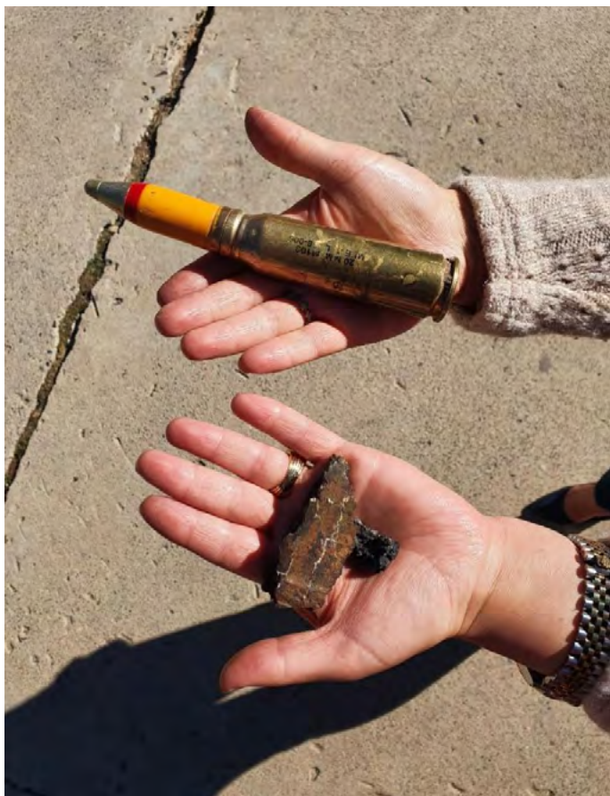
Schoolteacher holds shrapnel and unexploded munition from Turkish attacks on Hirure school. November 2021.